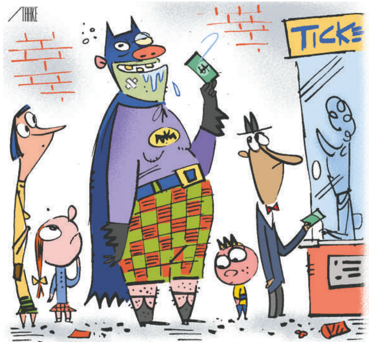
BOB STAAKE FOR THE WASHINGTON POST

in which we presented 100 “tile sets” of seven letters each from the ScrabbleGrams feature that appears daily in The Post, and asked you to come up with your own terms (all the tile sets were designed to generate only six-letter words). We got so many neologisms for this contest that we’re running them over two weeks. (See the first group in the June 9 Sunday Style section or online at bit.ly/invite1025 .)